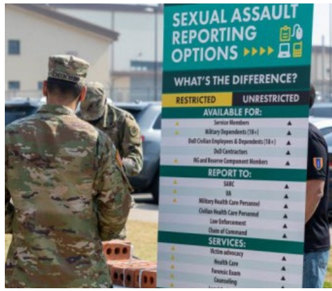
Soldiers stop by the sexual assault prevention exhibit to learn more about reporting options.

One of the main differences in the pilot refresher training is the decision by the Army to replace