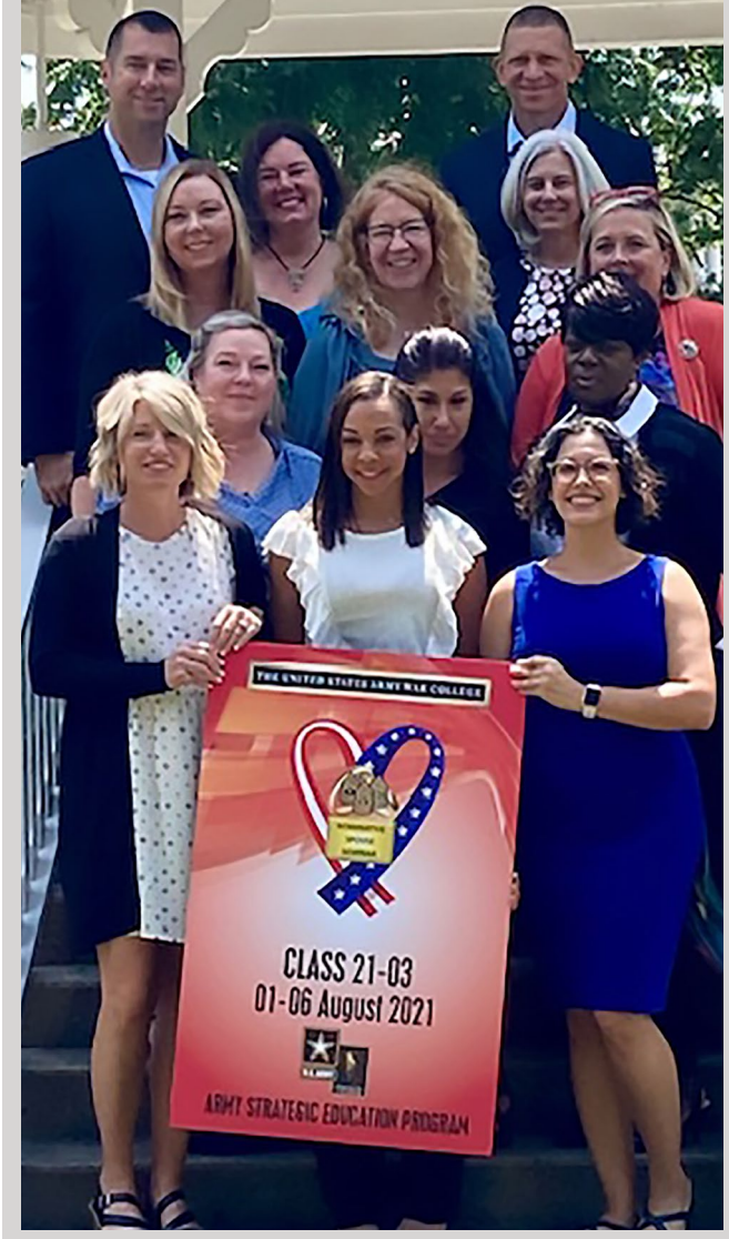
NSS 21-03 class photo.

For further information and to download forms go to www.sapr. mil/d-saacp, for additional resources, including a list of CEU Opportunities from NOVA go to www.trynova.org/ credentialing/d-saacp-dod/, and for information of Army Resilience Directorate Outreach Webinars, which frequently offer CEUs, visit www.armyresilience.army.mil/ard/ webinar.html.